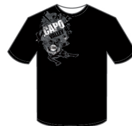
Unisex T-Shirt Black / White $15