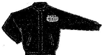
ZIPPER JACKET WITH HOOD- BLACK 2-COLOR LEFT CHEST $ 30.00