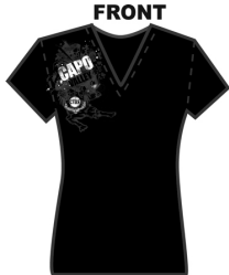
Ladies Black / White V-Neck Shirt $15