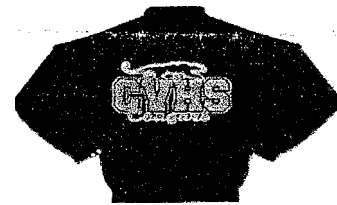
Black / White Hooded Sweatshirt $25